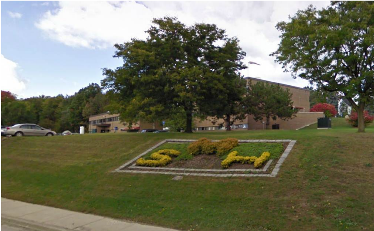
Stevenson Memorial Hospital Alliston, Ontario